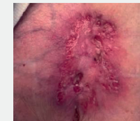
Second degree burn to shoulder area