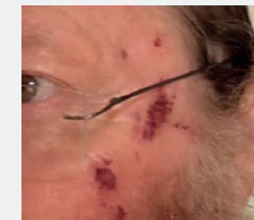
Superficial wound on face